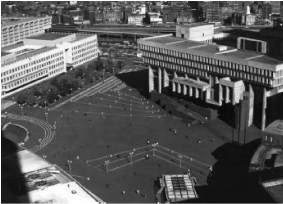
Figure 6: Case studies can be useful in redesigning existing projects such as currently is the case in the redesign of Boston's City Hall Plaza.