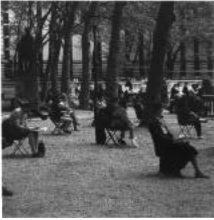
Figure 10: Bryant Park in use after renovation (Photo courtesy of Spacemaker Press).