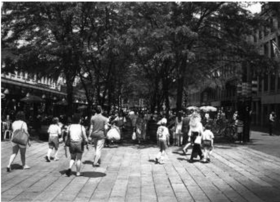
Figure 3: Boston's Faneuil Hall is an example of an urban landscape that has been developed as a case study.