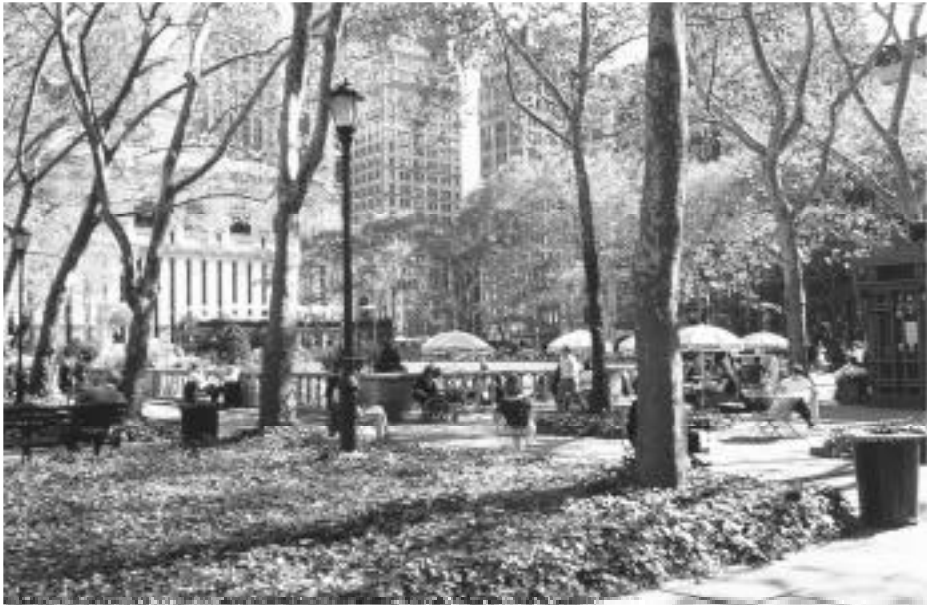
Figure 9: The Bryant Park Redesign Plan (Plan Courtesy of Olin Partnership).