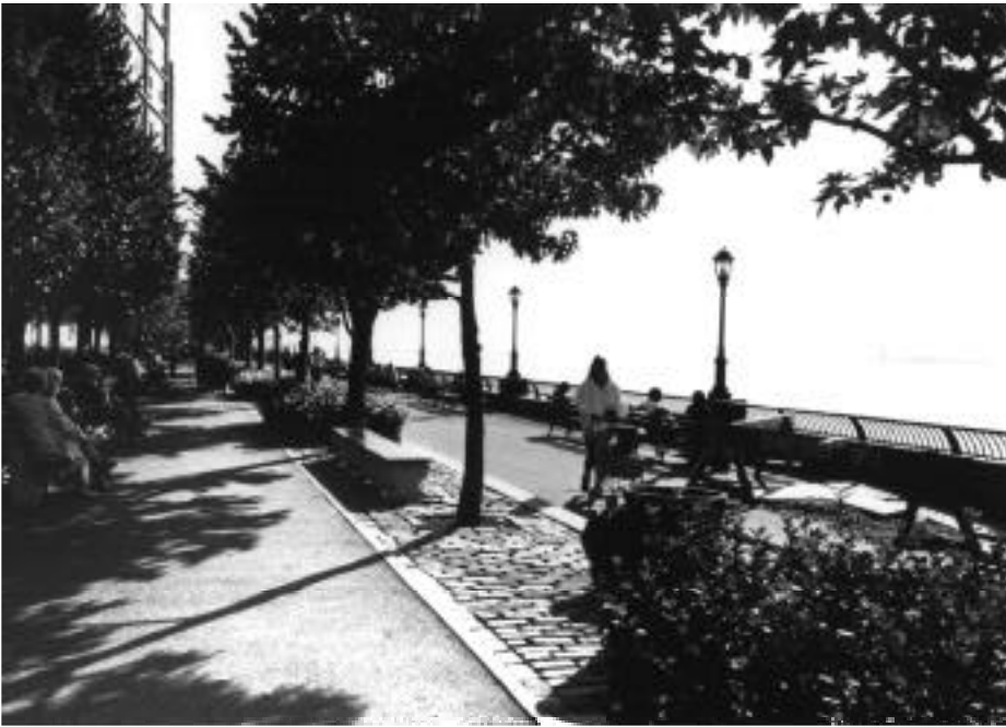
Figure 4: The Promenade at New York City's Battery Park City.