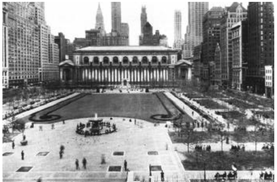
Figure 7: Early photo of Bryant Park, New York City.