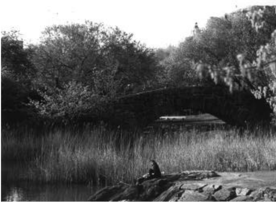
Figure 1: New York City's Central Park has been documented numerous times as a case study project.