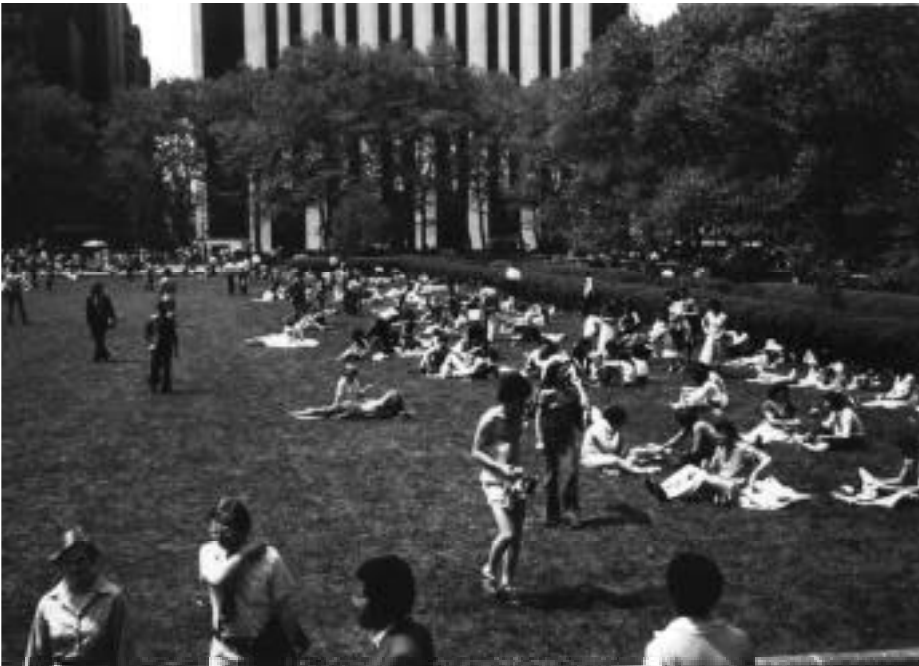
Figure 8: The central lawn area of Bryant Park in use before the park's renovation in the early 1990s.